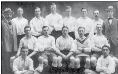
The 1914 Middlesex Wanderers touring party, which travelled to Spain to play Barcelona.