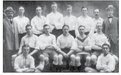
The 1914 Middlesex Wanderers touring party, which travelled to Spain to play Barcelona.