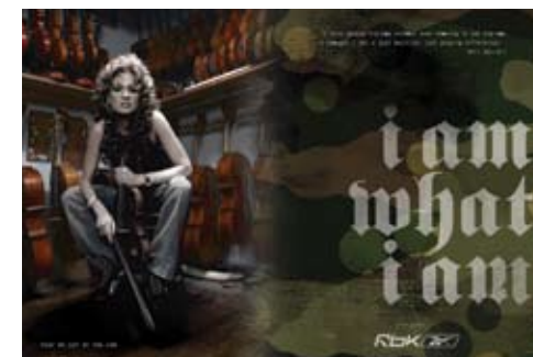
SPORTING IT These magazine ads from Reebok mark the second year of the company's $50 million "I am what I am" multi-channel campaign. The campaign is about people who have succeeded by overcoming obstacles in life, such as NBA star Allen Iverson and French tennis player Amelie Mauresmo .